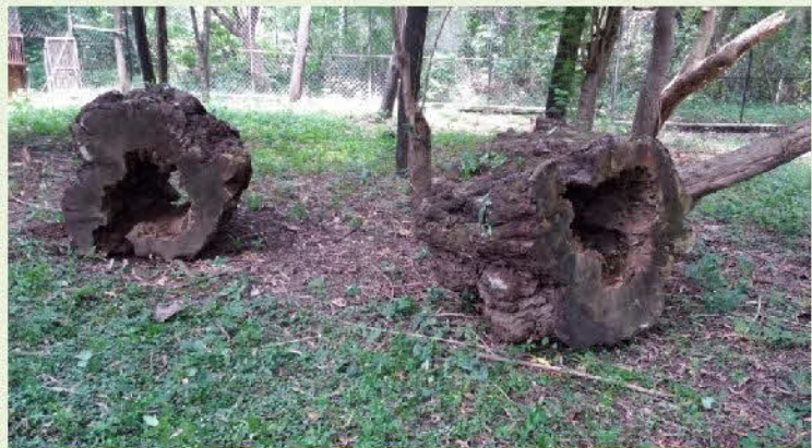
Wooden logs provided at Hyena enclosure for hiding