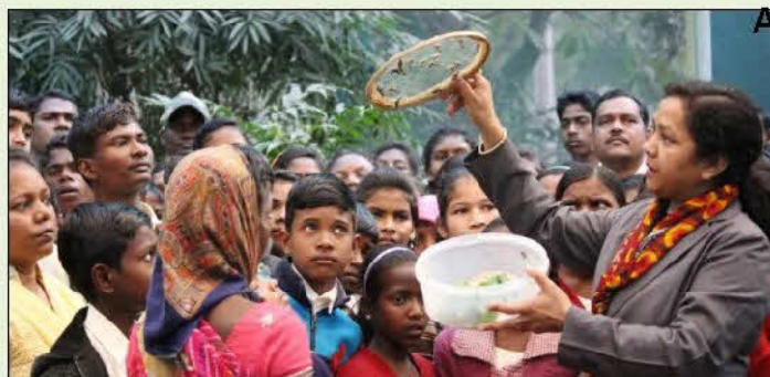
Exploration of Butterfly Park

E. Animal Welfare Fortnight 2016: Tata Steel Zoological Park (TSZP) organized a two week-long celebration from 16th to 30th January on the occasion of Animal Welfare Fortnight 2017.