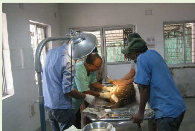
Population control measures 'Vasectomy' by Zoo vet team

• All the large cats were vaccinated against Feline Pan Leucopenia, Calcivirus, Herpes Virus and Rabies infection using Biofel PCHR vaccine under annual vaccination Schedule. The cloven footed animals were vaccinated against FMD every nine months.