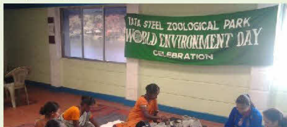
A workshop on theme “Best out of Waste” during WED-16