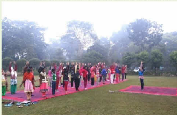
Camp participants in Yoga session

D. Nature Camp: The Residential Nature Camp for Girl Students on Awareness on Biodiversity & Wildlife Conservation is being organized by the Tata Steel Zoological Society for the past 9 years since April 2007. This year the camp was organized from 20th to 22nd December 2016 in which 48 girls and four teachers from three schools were participated. The curriculum involved yoga, bird watching, skill development and local excursion to Dalma Wildlife Sanctuary. The objective of the camp is to promote each girl child's personal development, to inspire the young women of today to become environmentally responsible and conscientious citizens of tomorrow.