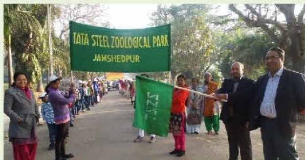
'Prabhat pheri' on Zoo Foundation Day

Tata Steel Zoological Park commemorated the World Forestry Day and Water day on 22 nd March 2016 at Haramdih- Govindpur (Daldali Panchayat) in Jamshedpur Block of East Singhbhum District, to spread the message of conservation amongst the rural masses. More than 250 children from village schools were oriented on the need and importance of forest and water conservation.