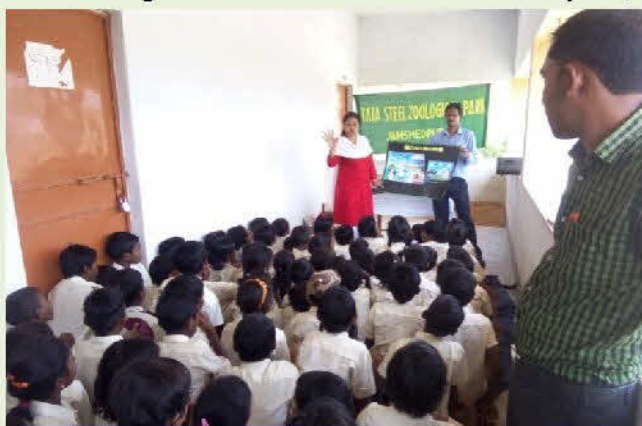
Celebration of World Forestry Day and Water day

G. Reaching out to the unreachable: This year,